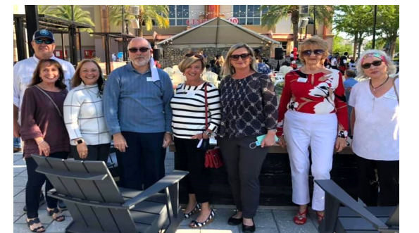
Amazing Give Workday Edition Wrap Party

We were thrilled to participate in the Amazing Give hosted by the Community Foundation again this year. The event took place on April 22nd beginning at 7am and finishing with a 7pm wrap party at Celebration Pointe . Thanks to our hard working team and generous donors, we raised over $45,000 for our programs.